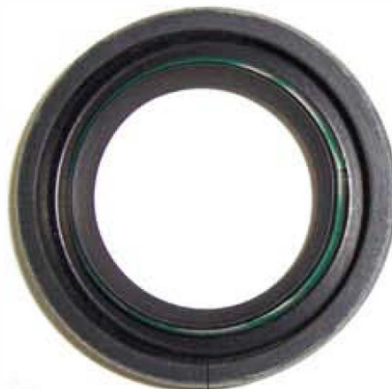
316 SS Garter Spring

Tides Marine's replacement nitrile lip seals are specifically designed for each sealing system (propeller shafts / rudder stocks) produced by Tides Marine.